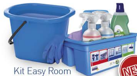
Kit Easy Room

Easy to prepare with the Easy Dose system Immediate focus on the destination area Easy to handle thanks to the Kit Easy Room