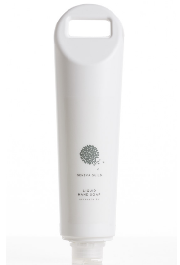
LIQUID HAND SOAP 340 ml e 11.5 fl. oz. HMR341LMGG

GENEVA GUILD LIQUID HAND SOAP GENTLY CLEANS YOUR HANDS, THE LIGHTLY SCENTED FORMULA IS ENRICHED WITH ALOE VERA EXTRACT WITH SOFTENING AND SOOTHING PROPERTIES.