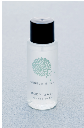
BODY WASH 30 ml e 1.01 fl. oz. P30BGG

GENEVA GUILD BODY WASH GENTLY CLEANS THE SKIN, THE LIGHTLY SCENTED FORMULA IS ENRICHED WITH ALOE VERA EXTRACT WITH SOFTENING AND SOOTHING PROPERTIES.