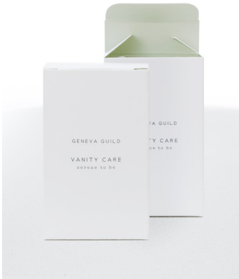
VANITY KIT in paper case DE02MAGG