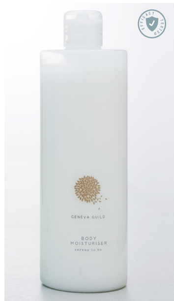
BODY MOISTURISER 380 ml e 12.8 fl. oz. FLR400BLGG

GENEVA GUILD BODY MOISTURISER IS ENRICHED WITH VITAMIN E AND SHEA BUTTER TO ABSORB QUICKLY AND RESTORE SKIN'S ELASTICITY WHILE DELIVERING SMOOTH, LONG-LASTING HYDRATION.