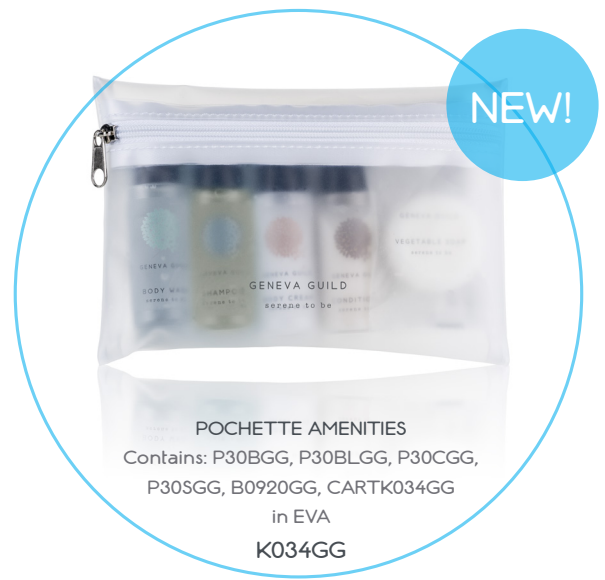
POCHETTE AMENITIES Contains: P30BGG, P30BLGG, P30CGG, P30SGG, B0920GG, CARTK034GG in EVA K034GG