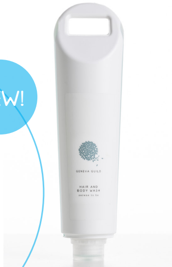
HAIR & BODY WASH 340 ml e 11.5 fl. oz. HMR341MGG