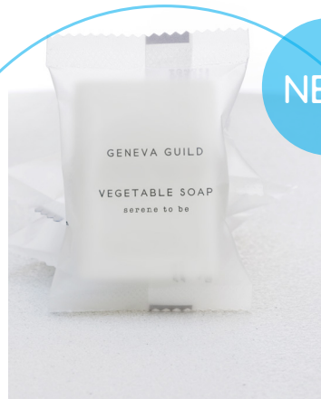
VEGETABLE SOAP 30 g e Net wt. 1.05 oz. B0830GG

GENEVA GUILD HAIR & BODY WASH GENTLY CLEANS FROM HEAD TO TOE. THE LIGHTLY SCENTED FORMULA IS ENRICHED WITH GREEN ANISE AND ORGANIC MELISSA EXTRACTS WITH PURIFYING PROPERTIES.