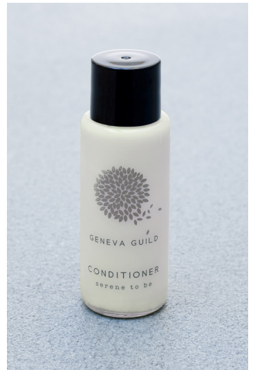
CONDITIONER 30 ml e 1.01 fl. oz. P30CGG

paraben free dermatologically tested no silicones