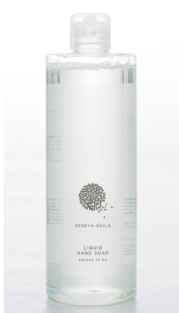
LIQUID HAND SOAP 380 ml e 12.8 fl. oz. FLR400LMGG

paraben free dermatologically tested no silicones no mineral oil