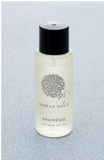
SHAMPOO 30 ml e 1.01 fl. oz. P30SGG

EVALUATION OF THE HYDRATING EFFICACY* This cream increases hydration by +19,3% after 60 minutes leaving skin hydrated also after 24 hours (+9%) *Independent Lab tests panel of 20 people for 24 hours