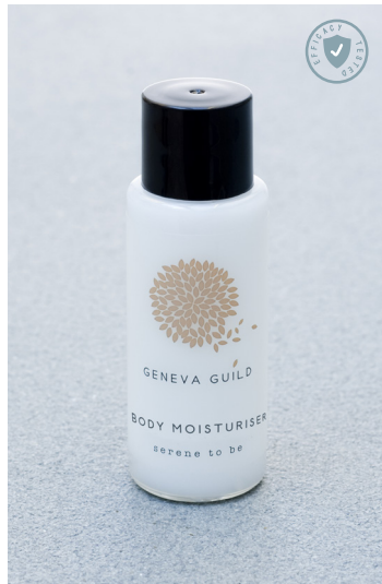
BODY MOISTURISER 29 ml e 0.98 fl. oz. P30BLGG

GENEVA GUILD BODY MOISTURISER IS ENRICHED WITH VITAMIN E AND SHEA BUTTER TO ABSORB QUICKLY AND RESTORE SKIN'S ELASTICITY WHILE DELIVERING SMOOTH, LONG-LASTING HYDRATION.