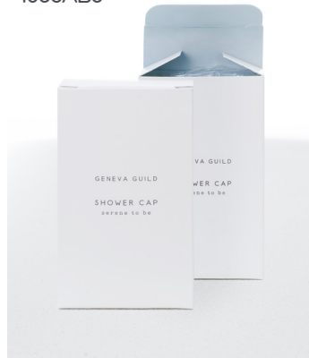
SHOWER CAP in paper case C02MAGG