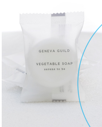
VEGETABLE SOAP 20 g e Net wt. 0.70 oz. B0920GG

GENEVA GUILD VEGETABLE SOAP IS THE IDEAL BODY CARE BAR TO USE ON A DAILY BASIS. ITS GENTLE CLEANSING ACTION CAN BE USED ALL OVER THE BODY TO LEAVE THE SKIN CLEAN AND REFRESHED.