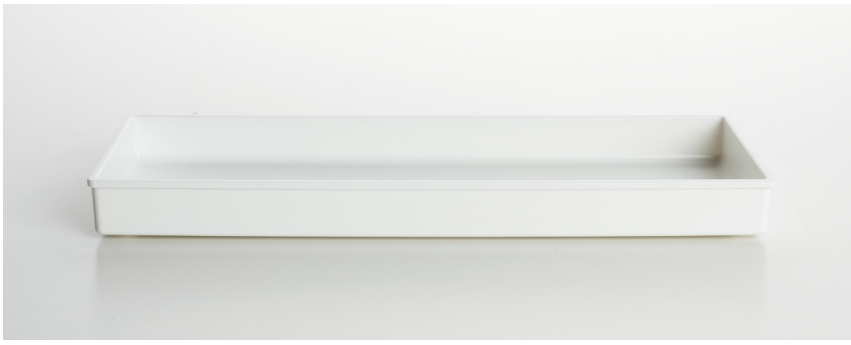
AMENITIES TRAY in white ABS I035ABS