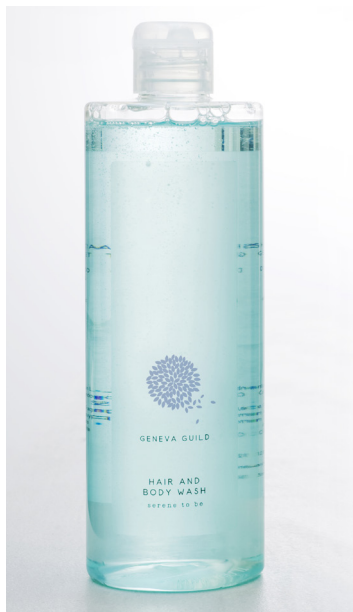
HAIR & BODY WASH 380 ml e 12.8 fl. oz. FLR400MGG

GENEVA GUILD HAIR & BODY WASH GENTLY CLEANS THE SKIN, THE LIGHTLY SCENTED FORMULA IS ENRICHED WITH GREEN ANISE AND ORGANIC MELISSA EXTRACTS WITH PURIFYING PROPERTIES.